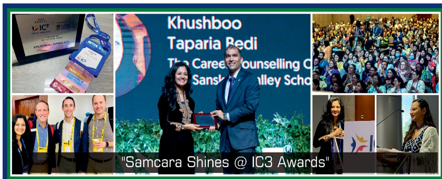
"Samcara Shines @ IC3 Awards"