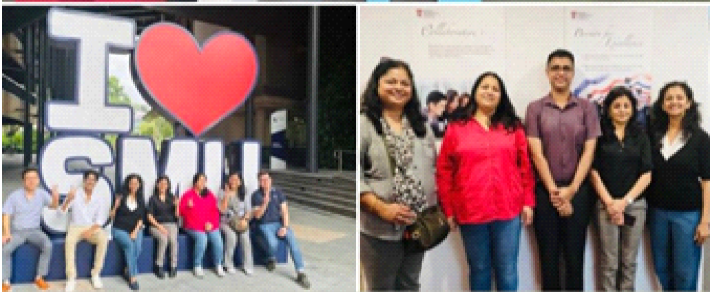
Visit to Singapore Universities @SIM @NTU @SMU

Enriched with understanding on Singapore education system, public and private universities, subsidised fee structure, bond for International students with Singapore Government, scholarships, student loans, admission criterias, culture, history and so much more! 80 counselors from South East Asia were part of the event.