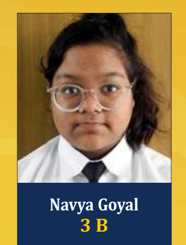
Notable Subject Achievements

: 19 out of 21 students got A* or A ICT Physics 16 out of 21 students got A* or A Chemistry 19 out of 25 students got A* or A Mathematics 21 out of 28 students got A* or A Biology 17 out of 26 students got A* or A Hindi 17 out of 26 students got A* or A History 03 out of 05 students got A* or A Business Studies 04 out of 07 students got A* or A Economics 03 out of 07 students got A* or A Literature (English) 11 out of 28 students got A* or A : 09 out of 28 students got A* or A First Language English 06 out of 22 students got A* or A Geography