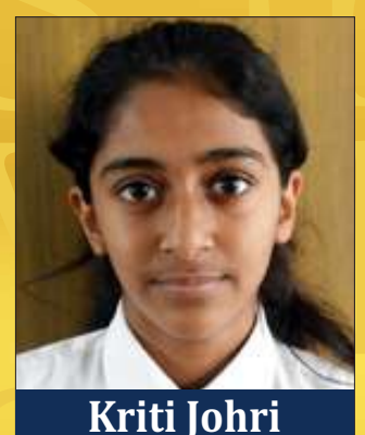
7A*, 1B (Out of 8 Subjects)