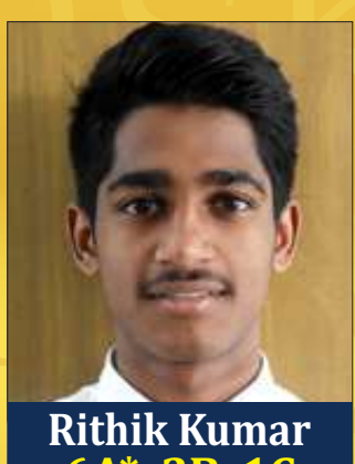
6A*, 2B, 1C (Out of 9 Subjects)