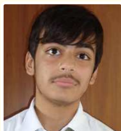
95.00 % Lavan