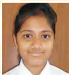
95.80 % Sanskriti