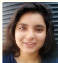
94.60 % Palak