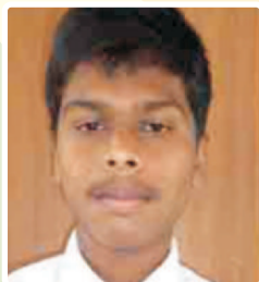
96.40 % Anunay