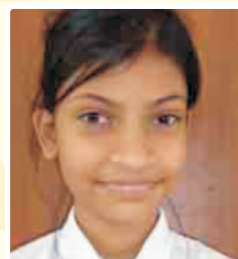
95.40 % Nishita