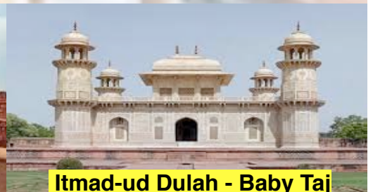
Itmad-ud Dulah - Baby Taj