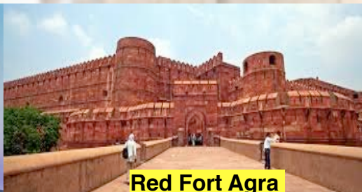
Red Fort Agra