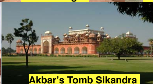
Akbar's Tomb Sikandra