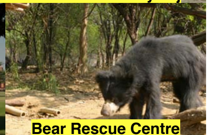
Bear Rescue Centre